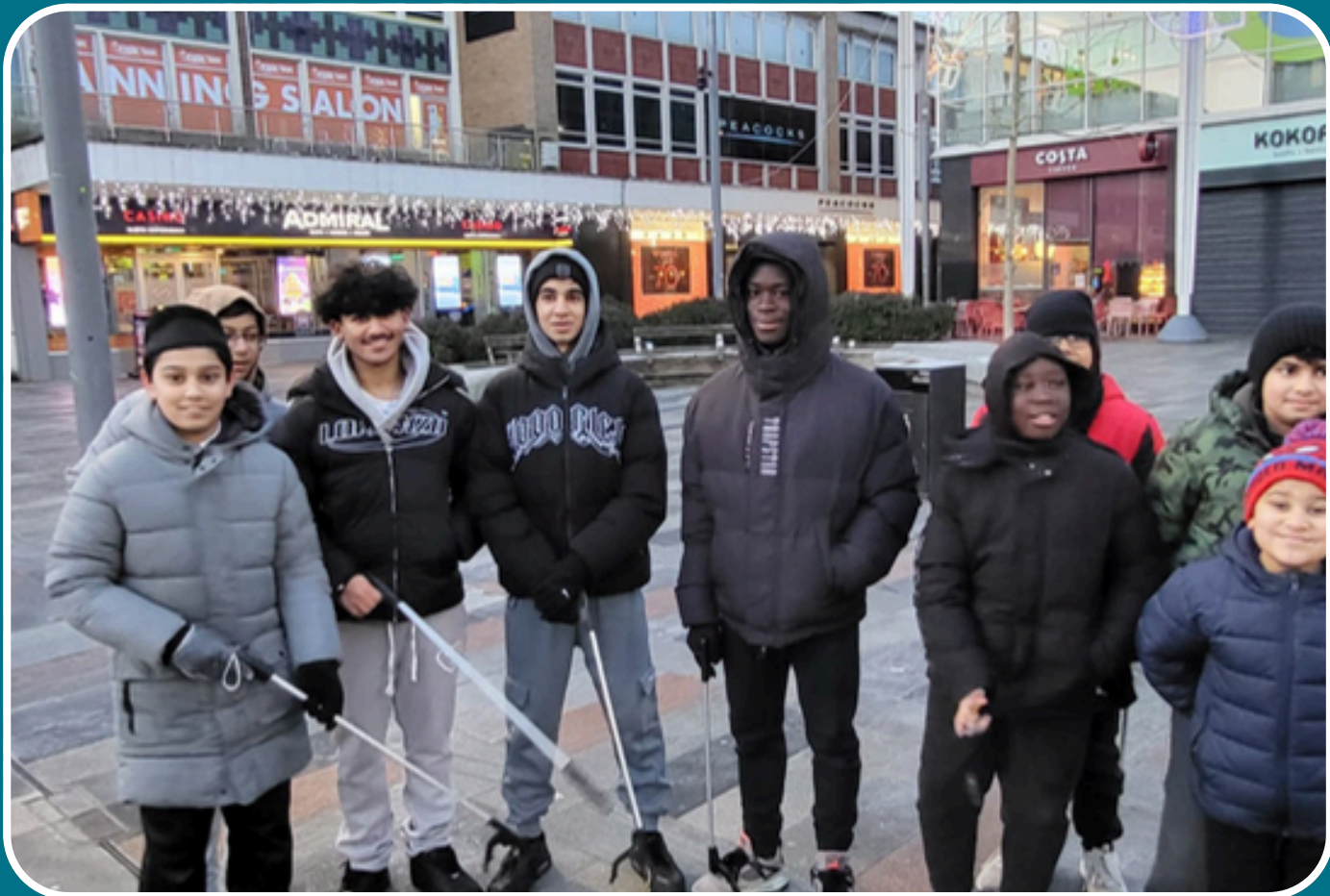
Crawley North+South New years day street cleaning