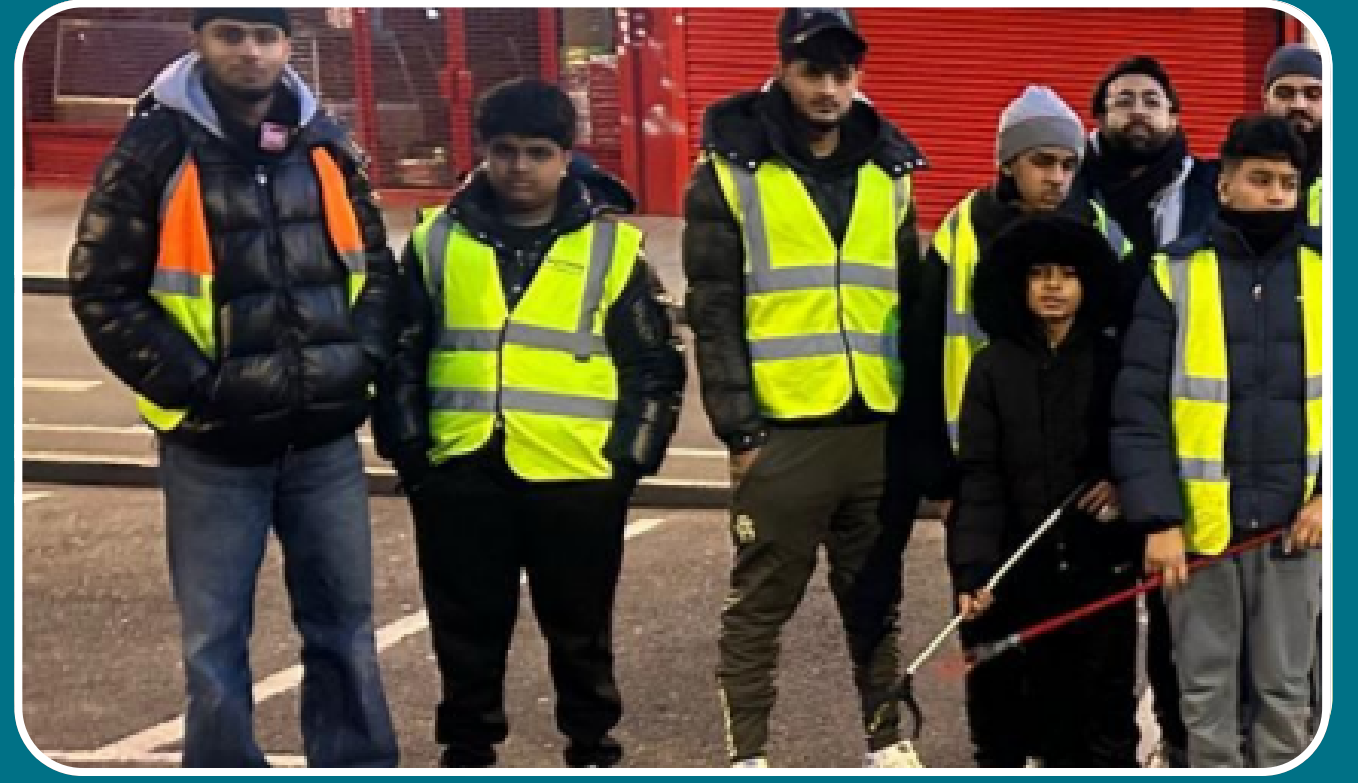
Selsdon New years day street cleaning