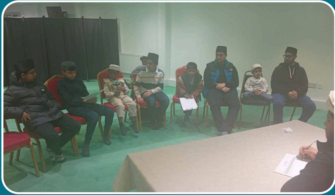
Crawley South local Waq-Fu-Neu Ijtema