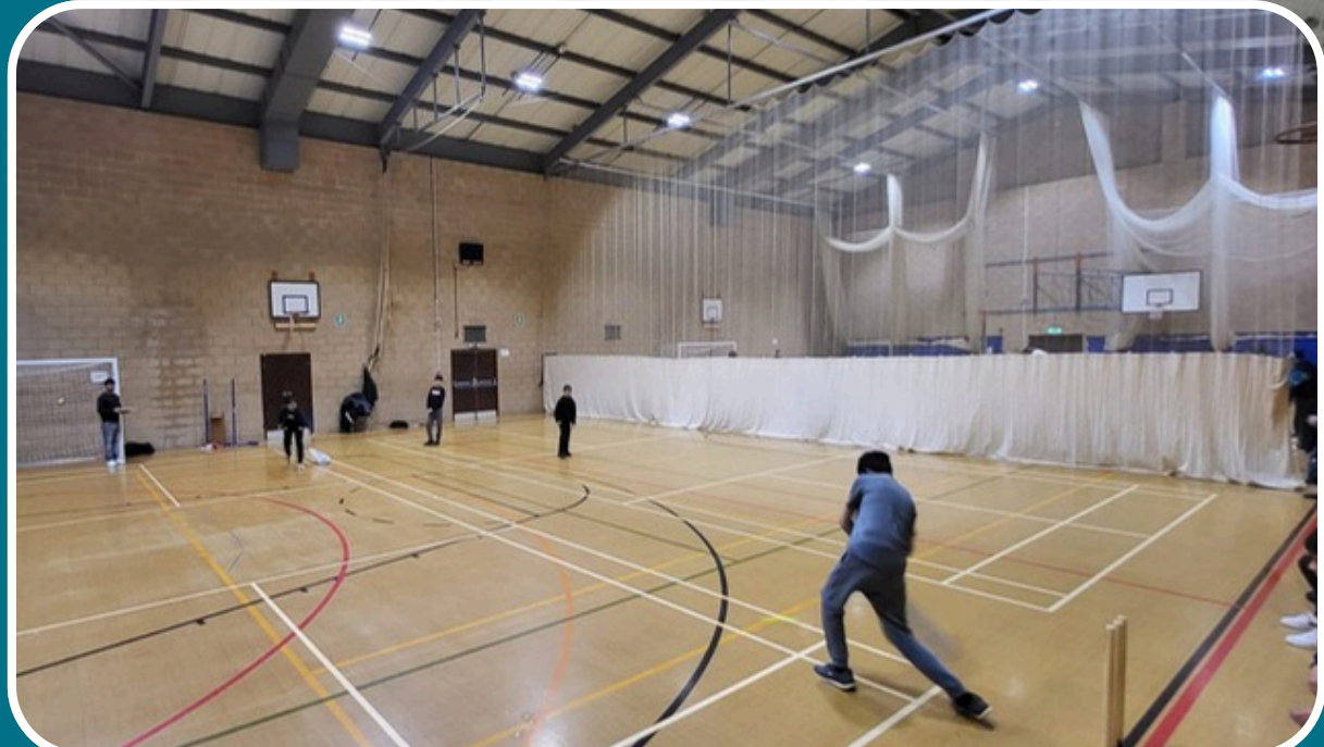
Crawley South local Ijtema