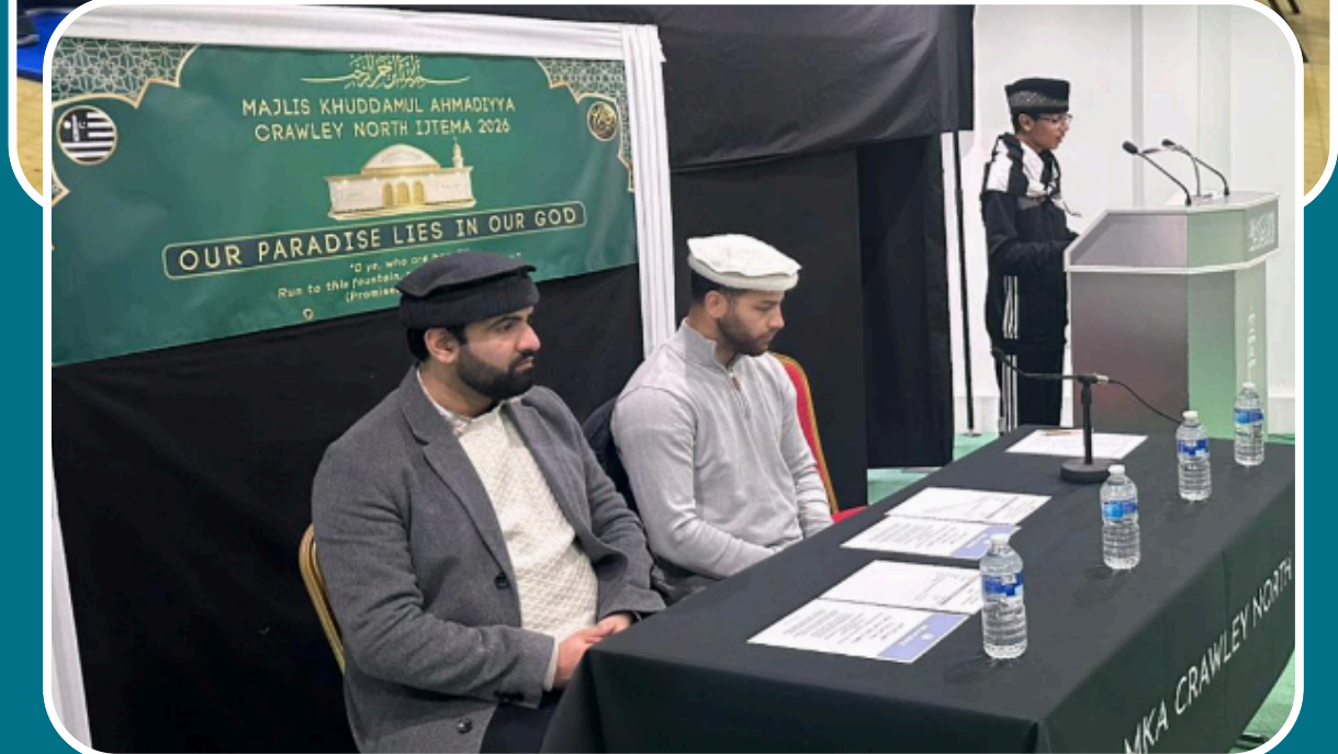
Crawley North local Ijtema