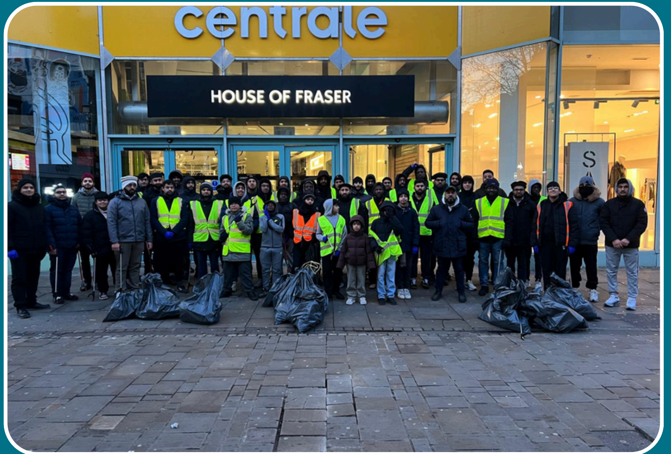
Central Croydon New years day street cleaning