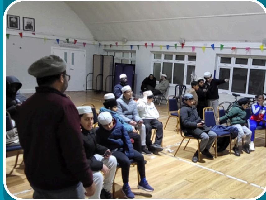
Crawley North+South Talim classes